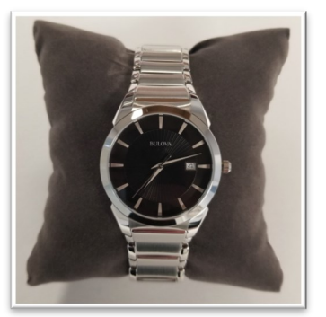
MEN WATCH-OPTION 1