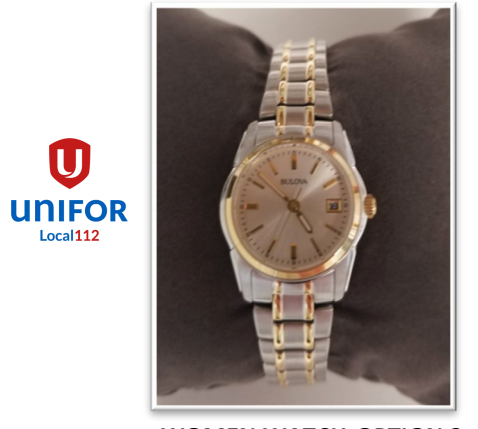
WOMEN WATCH-OPTION 2