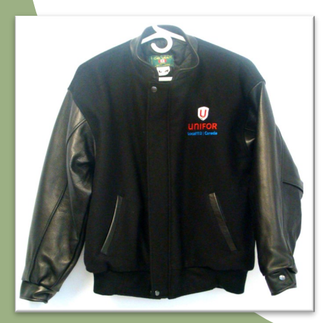
Varsity Style Melton Leather Jacket