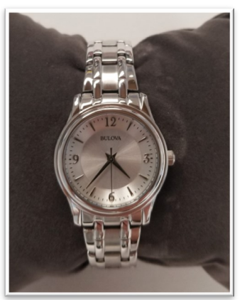
WOMEN WATCH-OPTION 1