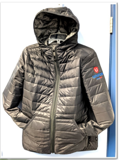
Women's Quilted Jacket